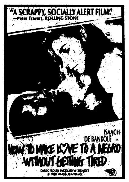
The numerous movies promoting racial equality or interracial marriage, such as the above ad depicts, are almost always Jewish produced, directed, written or financed.

except its merits have previously been taught from the pulpits. An example of this is race equality which led to integration and ultimately to mongrelization. The gullible clergy in one breath instruct their parishioners that we are a special, chosen people while in another breath proclaim all races are the Their inconsame. sistency is never discovered. So we Jews enjoy a special place in society while all other races are reduced to common It is for this equality. reason that we authored the equality hoax, thereby reducing all to a lower level.