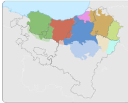
Schematic dialect auries o Basque. Licht-coloured dialects are extinct. See dialects ablo for details.

Apairt frae this staandardized version, there are sax main Basque dialects, correspondin tae the abuin mentioned historic provinces populatit bi Basques: Bizkaian , Gipuzkoan , an Upper Navarrese in Spain an Lower Navarrese , Lapurcian , an Zuberoan (in Fraunce). Housomeivver, the dialect boondars are no congruent wi poletical boondars.